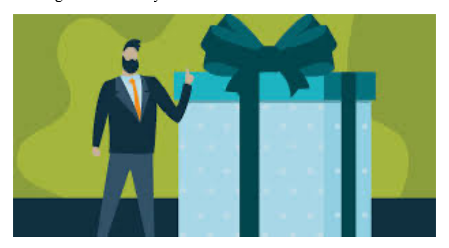
What is Grace in all its fullness?